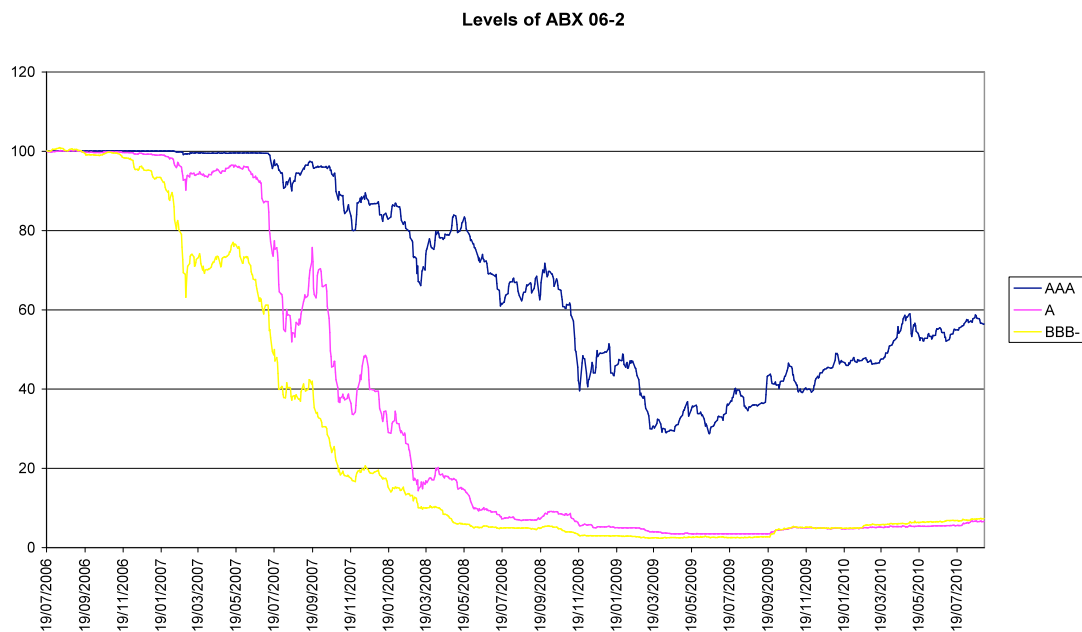
Figure 1 Levels of the ABX 06-01 and 06-2.